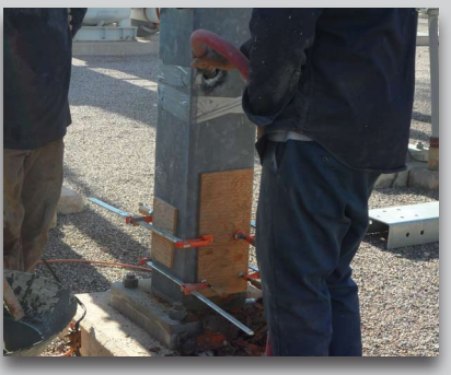
Fill the inside of the column with grout