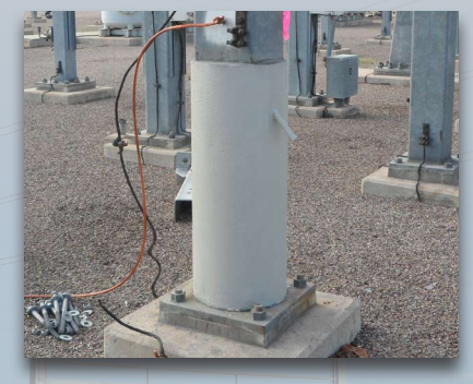
Remove ratchet straps & paint jacket (if desired)