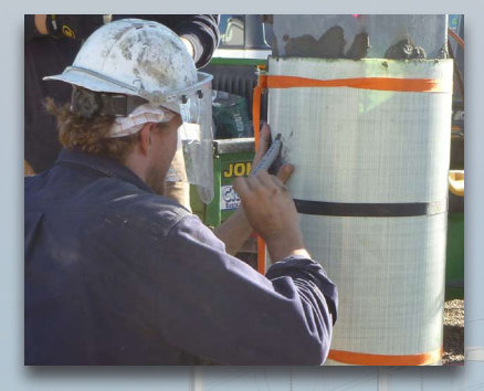
Insert drain pipe (if required)