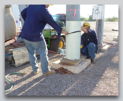
Use ratchet straps to support shell temporarily